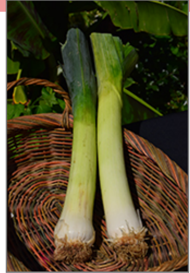
American Flag Leeks fruit

This plant is typically grown in a designated vegetable garden. It does best in full sun to partial shade. It does best in average to evenly moist conditions, but will not tolerate standing water. It is not particular as to soil pH, but grows best in rich soils. It is highly tolerant of urban pollution and will even thrive in inner city environments. Consider applying a thick mulch around the root zone over the growing season to conserve soil moisture. This species is not originally from North America.