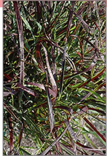
Blood Brothers Red Switch Grass foliage