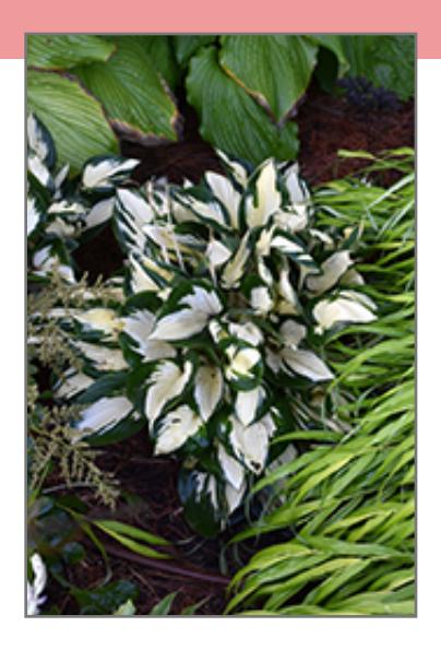
Fire and Ice Hosta

Fire and Ice Hosta is recommended for the following landscape applications;