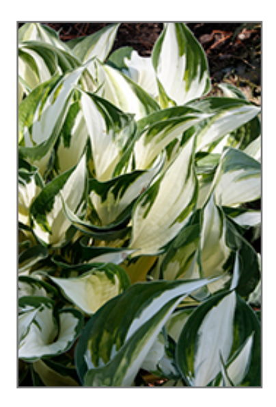
Fire and Ice Hosta foliage