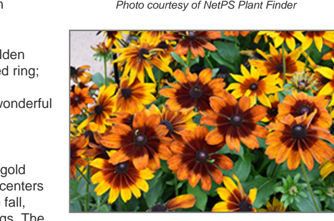
Cappuccino Coneflower flowers

Cappuccino Coneflower is recommended for the following landscape applications;