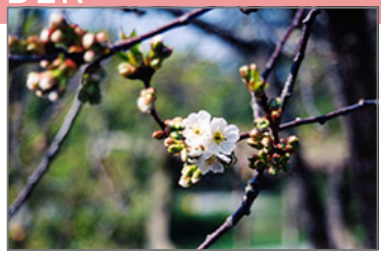
Montmorency Cherry flowers

This is a deciduous tree with a shapely oval form. Its average texture blends into the landscape, but can be balanced by one or two finer or coarser trees or shrubs for an effective composition. This plant will require occasional maintenance and upkeep, and is best pruned in late winter once the threat of extreme cold has passed. It is a good choice for attracting birds to your yard. It has no significant negative characteristics.