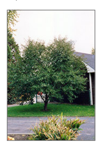
Montmorency Cherry