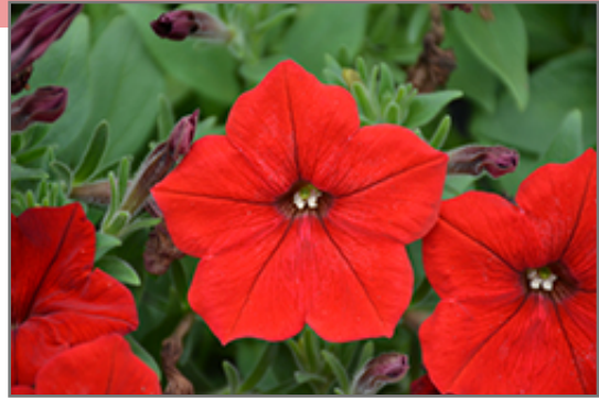
Easy Wave Red Petunia flowers

This plant will require occasional maintenance and upkeep. Trim off the flower heads after they fade and die to encourage more blooms late into the season. It is a good choice for attracting hummingbirds to your yard, but is not particularly attractive to deer who tend to leave it alone in favor of tastier treats. It has no significant negative characteristics.