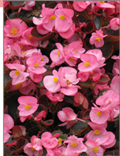
Bada Boom Pink Begonia flowers