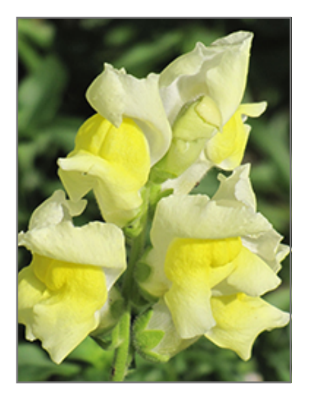
Snapshot Yellow Snapdragon flowers