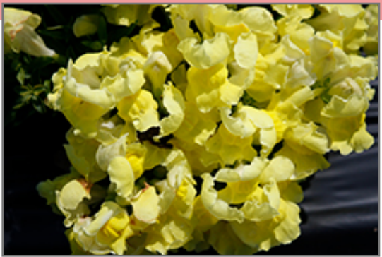
Snapshot Yellow Snapdragon flowers

This plant will require occasional maintenance and upkeep, and should not require much pruning, except when necessary, such as to remove dieback. It is a good choice for attracting bees and hummingbirds to your yard, but is not particularly attractive to deer who tend to leave it alone in favor of tastier treats. It has no significant negative characteristics.