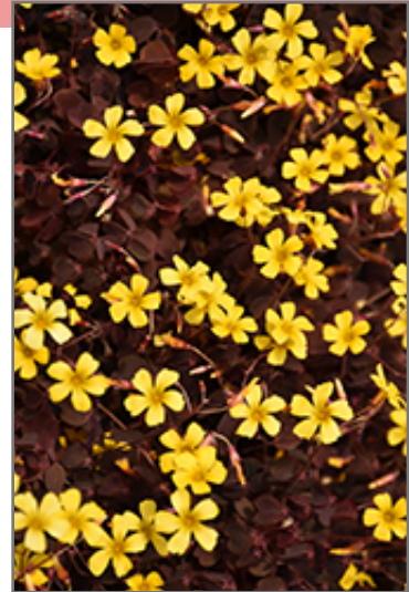
Burgundy Bliss Shamrock flowers