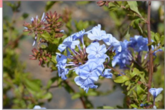
Imperial Blue Plumbago flowers

Imperial Blue Plumbago is recommended for the following landscape applications;