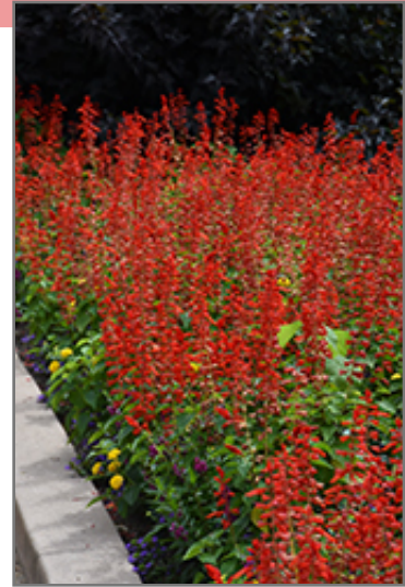
Lighthouse Red Sage in bloom

Lighthouse Red Sage is recommended for the following landscape applications;