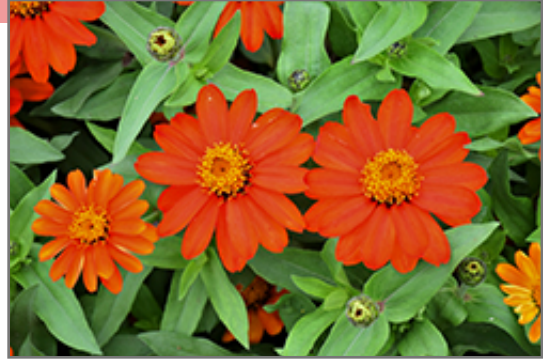
Zahara Fire Zinnia flowers

Zahara Fire Zinnia is recommended for the following landscape applications;