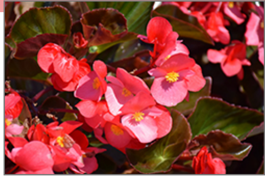
Whopper Rose Bronze Leaf Begonia flowers