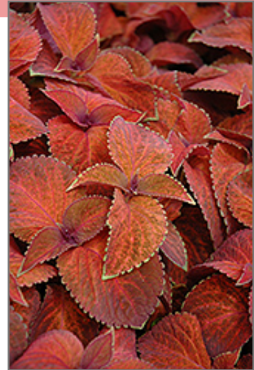
Wizard Sunset Coleus foliage

Wizard Sunset Coleus is recommended for the following landscape applications;