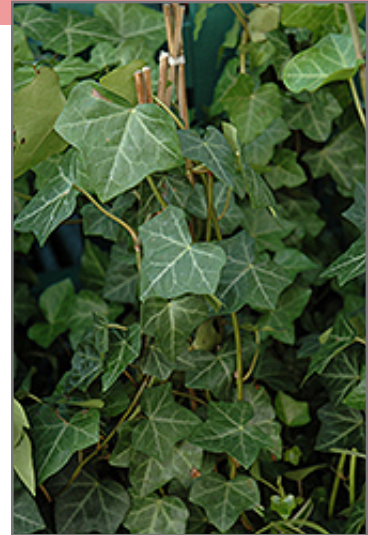
Thorndale Ivy foliage