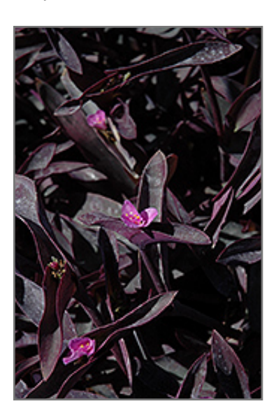
Purple Queen flowers