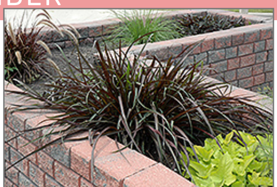
Vertigo Fountain Grass