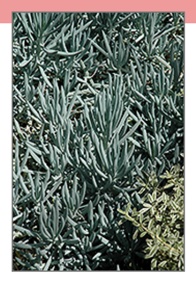
Blue Chalk Sticks foliage