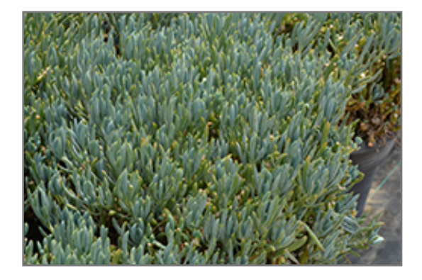
Blue Chalk Sticks