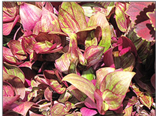
Purple Wandering Jew foliage