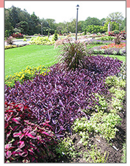
Purple Heart Spider Lily

This is a relatively low maintenance plant, and is best cleaned up in early spring before it resumes active growth for the season. It is a good choice for attracting butterflies to your yard, but is not particularly attractive to deer who tend to leave it alone in favor of tastier treats. It has no significant negative characteristics.