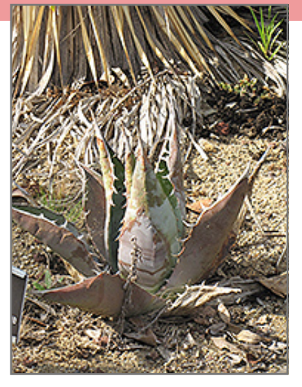
Rancho Tambor Agave