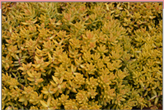
Coppertone Stonecrop foliage