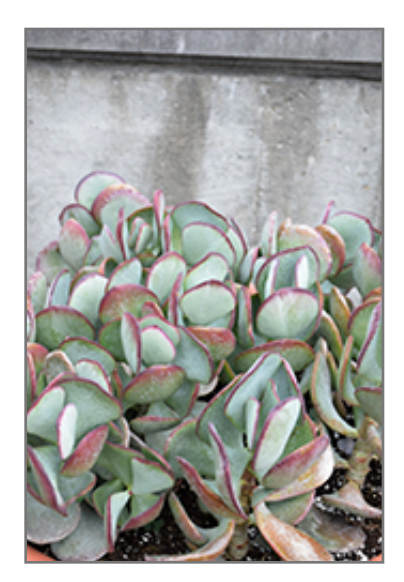
Silver Dollar Plant