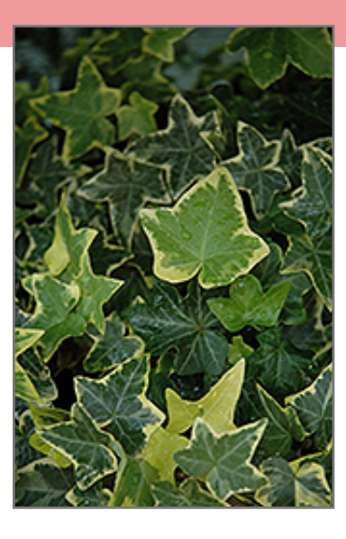
Gold Child Ivy foliage

When grown indoors, Gold Child Ivy can be expected to grow to be about 10 feet tall at maturity, with a spread of 3 feet. It grows at a medium rate, and under ideal conditions can be expected to live for approximately 30 years. This houseplant performs well in both bright or indirect sunlight and strong artificial light, and can therefore be situated in almost any well-lit room or location. It prefers to grow in average to moist soil. The surface of the soil shouldn't be allowed to dry out completely, and so you should expect to water this plant once and possibly even twice each week. Be aware that your particular watering schedule may vary depending on its location in the room, the pot size, plant size and other conditions; if in doubt, ask one of our experts in the store for advice. It is not particular as to soil pH, but grows best in rich soil. Contact the store for specific recommendations on pre-mixed potting soil for this plant. Be warned that parts of this plant are known to be toxic to humans and animals, so special care should be exercised if growing it around children and pets.