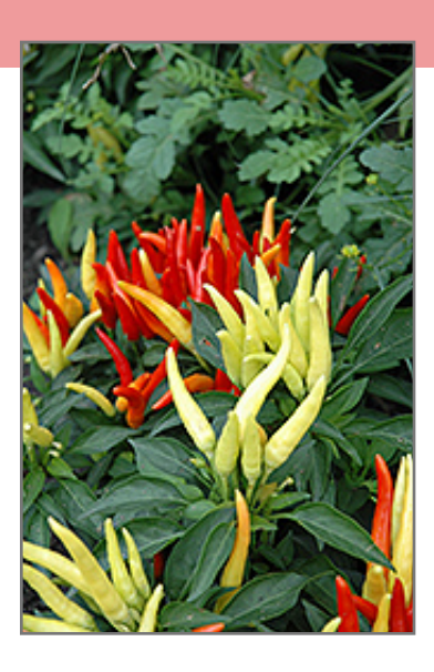
Chilly Chili Ornamental Pepper fruit

When grown indoors, Chilly Chili Ornamental Pepper can be expected to grow to be about 16 inches tall at maturity, with a spread of 18 inches. It grows at a medium rate, and under ideal conditions can be expected to live for approximately 1 years. This houseplant requires direct sun for optimal performance, and should therefore be situated in a room that gets bright sunlight for a good part of the day; it is not a good choice for rooms lit only by artificial light. It is very adaptable to both dry and moist soil, but will not tolerate any standing water. The surface of the soil shouldn't be allowed to dry out completely, and so you should expect to water this plant once and possibly even twice each week. Be aware that your particular watering schedule may vary depending on its location in the room, the pot size, plant size and other conditions; if in doubt, ask one of our experts in the store for advice. It is not particular as to soil type or pH; an average potting soil should work just fine.