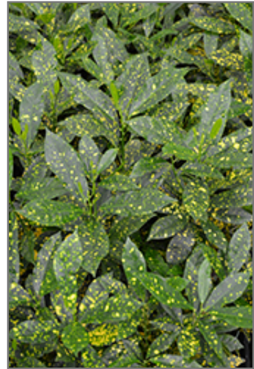
Gold Dust Variegated Croton foliage