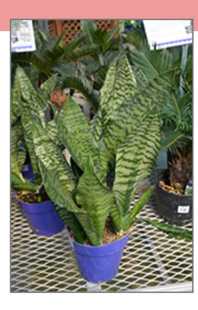
Futura Robusta Snake Plant

When grown indoors, Futura Robusta Snake Plant can be expected to grow to be about 24 inches tall at maturity, with a spread of 12 inches. It grows at a slow rate, and under ideal conditions can be expected to live for approximately 10 years. This houseplant performs well in both bright or indirect sunlight and strong artificial light, and can therefore be situated in almost any well-lit room or location. It is very adaptable to both dry and moist soil, and should do just fine under average home conditions. The surface of the soil shouldn't be allowed to dry out completely, and so you should expect to water this plant once and possibly even twice each week. Be aware that your particular watering schedule may vary depending on its location in the room, the pot size, plant size and other conditions; if in doubt, ask one of our experts in the store for advice. It is not particular as to soil pH, but grows best in sandy soil. Contact the store for specific recommendations on pre-mixed potting soil for this plant.