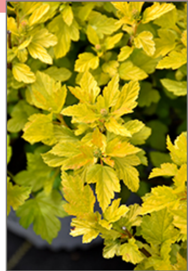
Tiny Wine Gold Ninebark foliage

Tiny Wine Gold Ninebark is recommended for the following landscape applications;