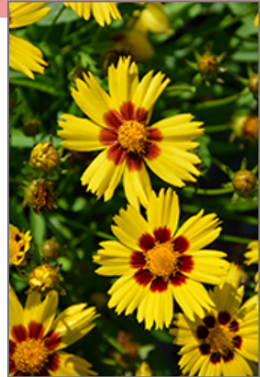
Sunkiss Tickseed flowers