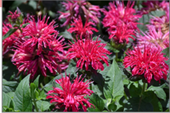
Balmy Rose Beebalm flowers