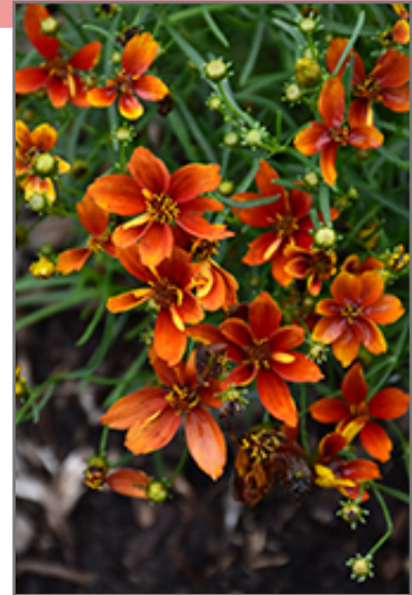
Sizzle And Spice Crazy Cayenne Tickseed flowers

Sizzle And Spice Crazy Cayenne Tickseed is recommended for the following landscape applications;