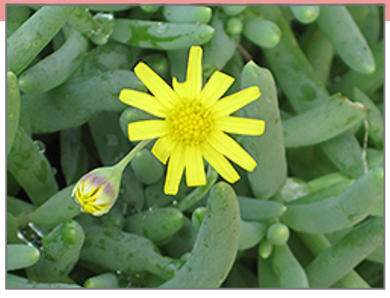
Little Pickles flowers

Little Pickles is recommended for the following landscape applications;