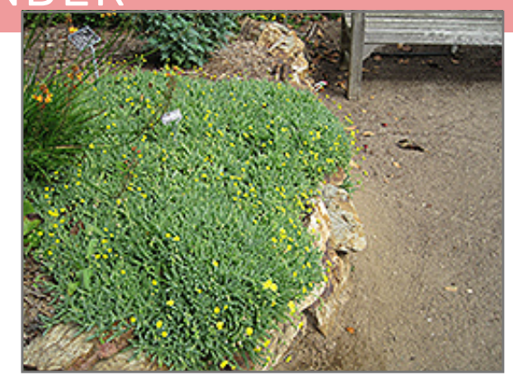
Little Pickles in bloom

Little Pickles will grow to be only 4 inches tall at maturity extending to 6 inches tall with the flowers, with a spread of 12 inches. Although it's not a true annual, this plant can be expected to behave as an annual in our climate if left outdoors over the winter, usually needing replacement the following year. As such, gardeners should take into consideration that it will perform differently than it would in its native habitat.