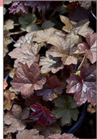
Palace Purple Coral Bells foliage

Palace Purple Coral Bells is recommended for the following landscape applications;