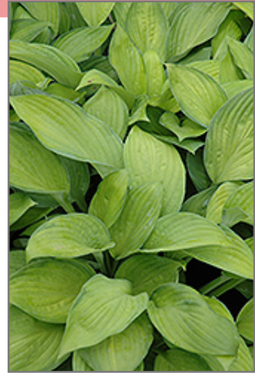
Gold Standard Hosta foliage

Gold Standard Hosta is recommended for the following landscape applications;