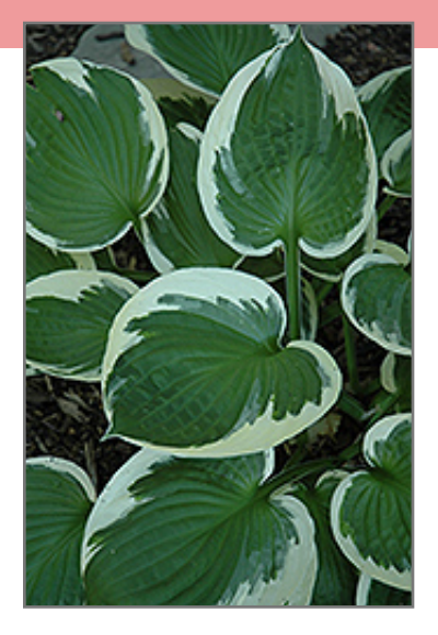
Minuteman Hosta foliage

Minuteman Hosta is a dense herbaceous perennial with tall flower stalks held atop a low mound of foliage. Its relatively coarse texture can be used to stand it apart from other garden plants with finer foliage.