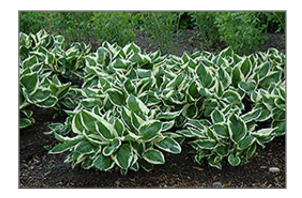
Minuteman Hosta

This is a relatively low maintenance plant, and is best cleaned up in early spring before it resumes active growth for the season. Gardeners should be aware of the following characteristic(s) that may warrant special consideration;