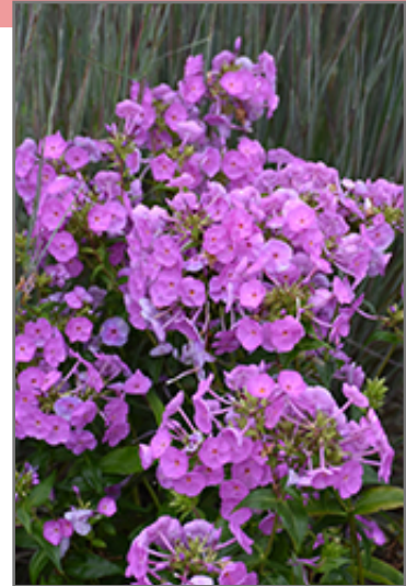
Fashionably Early Flamingo Garden Phlox flowers