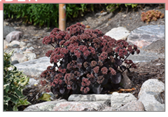
Night Embers Stonecrop in bloom

Night Embers Stonecrop is a dense herbaceous perennial with an upright spreading habit of growth. Its relatively coarse texture can be used to stand it apart from other garden plants with finer foliage.