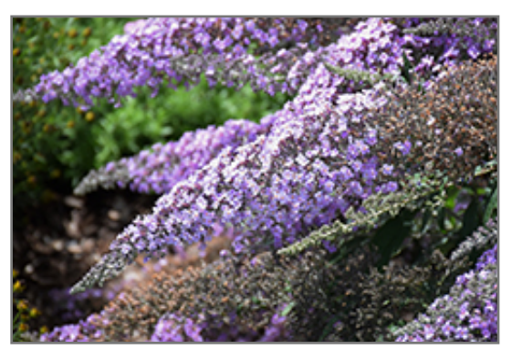
Grand Cascade Butterfly Bush flowers

Grand Cascade Butterfly Bush is an open multi-stemmed deciduous shrub with a shapely form and gracefully arching branches. Its average texture blends into the landscape, but can be balanced by one or two finer or coarser trees or shrubs for an effective composition.