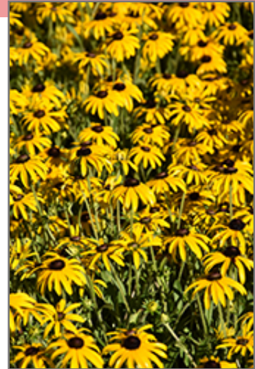
American Gold Rush Coneflower flowers

American Gold Rush Coneflower is a fine choice for the garden, but it is also a good selection for planting in outdoor pots and containers. With its upright habit of growth, it is best suited for use as a 'thriller' in the 'spiller-thriller-filler' container combination; plant it near the center of the pot, surrounded by smaller plants and those that spill over the edges. Note that when growing plants in outdoor containers and baskets, they may require more frequent waterings than they would in the yard or garden.