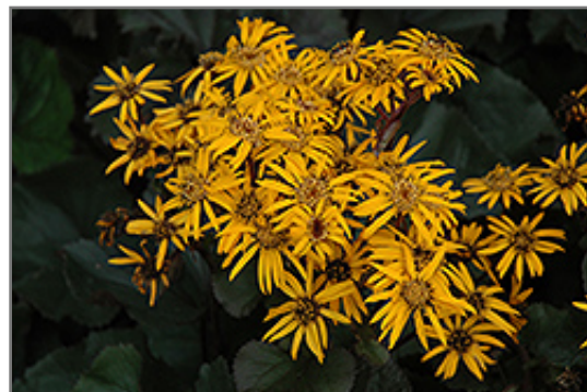
Britt Marie Crawford Rayflower flowers