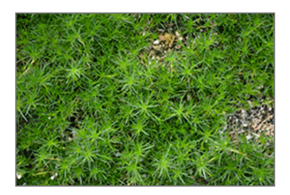
Irish Moss foliage