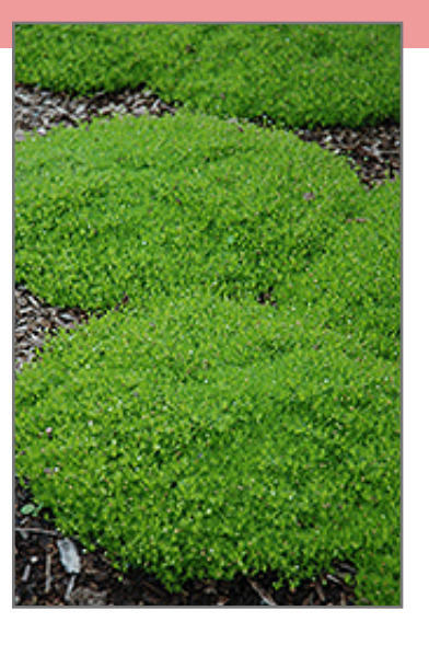
Irish Moss