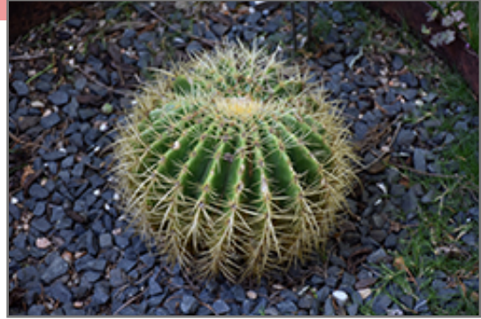
Golden Barrel Cactus

Golden Barrel Cactus is a succulent evergreen plant. It is a member of the cactus family, which are grown primarily for their characteristic shapes, their interesting features and textures, and their high tolerance for hot, dry growing environments. Like all cacti, it doesn't actually have leaves, but rather modified succulent stems that comprise the bulk of the plant, and which are designed to hold water for long periods of time. This particular cactus is valued for its distinctive barrel shape, and usually grows as a single spiny ribbed green stem. This plant has yellow cup-shaped flowers held atop the stems from late spring to early summer, which are interesting on close inspection.