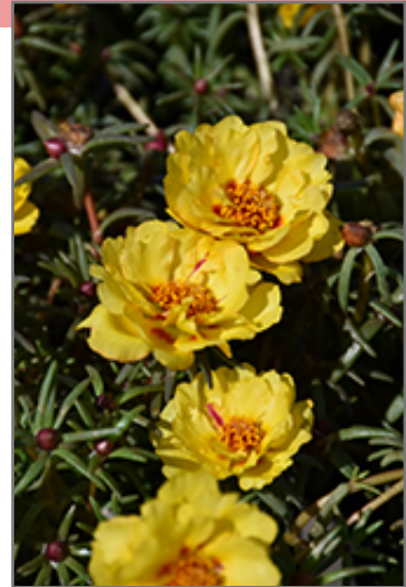
Happy Hour Banana Portulaca flowers

Happy Hour Banana Portulaca is recommended for the following landscape applications;