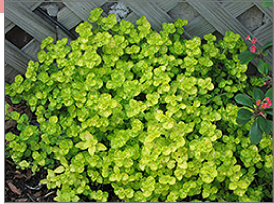
Golden Oregano

Aside from its primary use as an edible, Golden Oregano is suitable for the following landscape applications;