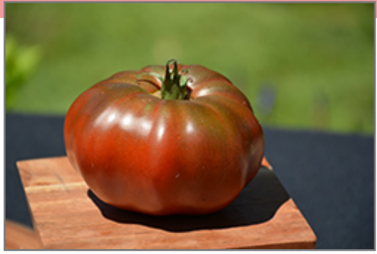
Black Krim Tomato fruit

Black Krim Tomato will grow to be about 4 feet tall at maturity, with a spread of 18 inches. When planted in rows, individual plants should be spaced approximately 24 inches apart. Because of its vigorous growth habit, it may require staking or supplemental support. This fast-growing vegetable plant is an annual, which means that it will grow for one season in your garden and then die after producing a crop.