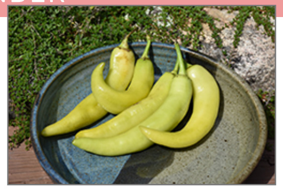
Sweet Banana Pepper fruit

Sweet Banana Pepper will grow to be about 24 inches tall at maturity, with a spread of 12 inches. When planted in rows, individual plants should be spaced approximately 24 inches apart. This vegetable plant is an annual, which means that it will grow for one season in your garden and then die after producing a crop.