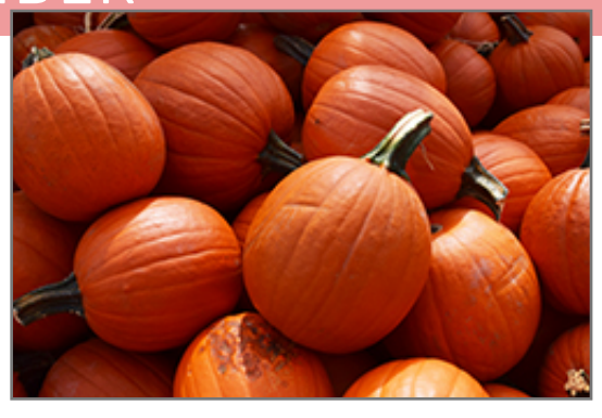
Small Sugar Pumpkin fruit

Small Sugar Pumpkin will grow to be about 24 inches tall at maturity, with a spread of 6 feet. This vegetable plant is an annual, which means that it will grow for one season in your garden and then die after producing a crop.