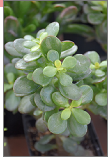
Baby Jade Plant foliage

This is a multi-stemmed evergreen houseplant with an upright spreading habit of growth. This plant can be pruned at any time to keep it looking its best.