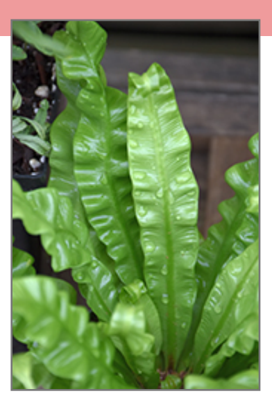
Crispy Wave Fern foliage

When grown indoors, Crispy Wave Fern can be expected to grow to be about 24 inches tall at maturity, with a spread of 18 inches. It grows at a slow rate, and under ideal conditions can be expected to live for approximately 15 years. This houseplant performs well in both bright or indirect sunlight and strong artificial light, and can therefore be situated in almost any well-lit room or location. It does best in average to evenly moist soil, but will not tolerate standing water. The surface of the soil shouldn't be allowed to dry out completely, and so you should expect to water this plant once and possibly even twice each week. Be aware that your particular watering schedule may vary depending on its location in the room, the pot size, plant size and other conditions; if in doubt, ask one of our experts in the store for advice. It is not particular as to soil pH, but grows best in rich soil. Contact the store for specific recommendations on pre-mixed potting soil for this plant.