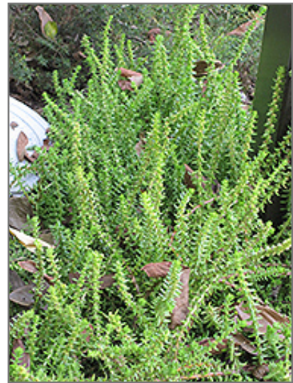
Watch Chain Crassula